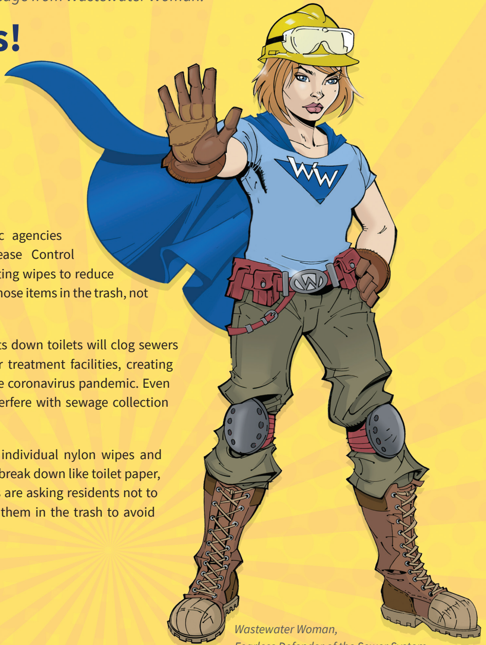
Wastewater Woman, Fearless Defender of the Sewer System

Wipes are among the leading causes of sewer system backups, impacting sewer system and treatment plant pumps and treatment systems.